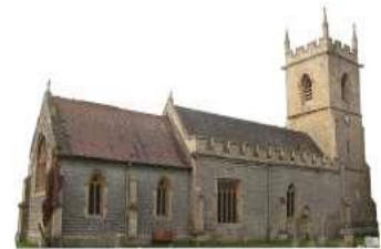
Hinton on the Green